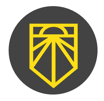
Fridays fo Future USA