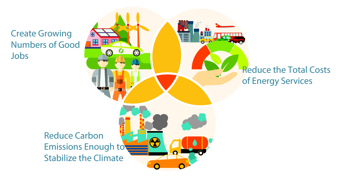
Figure 1. Do the three circles overlap?

Each of these problems could be addressed on its own. But can they be solved at the same time? Is there a plan that reduces carbon emissions enough to stabilize the climate, creates growing numbers of good jobs, and at the same time avoids imposing new costs on consumers and taxpayers? In terms of Figure 1, it is easy to imagine plans that fall into any one of the circles. But is there any viable future that falls within all three?